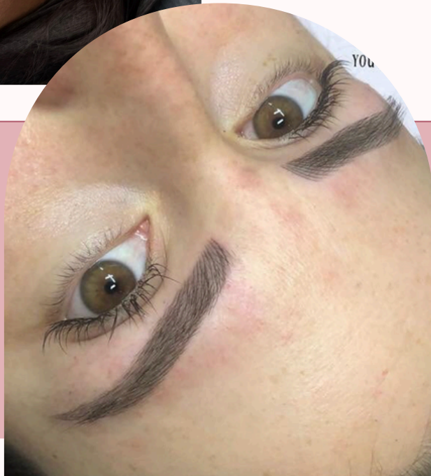
Feathering healed before touch up