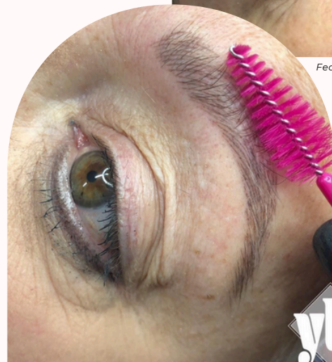
Feathering healed before touch up