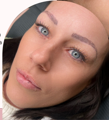
Microblading healed after 6 weeks