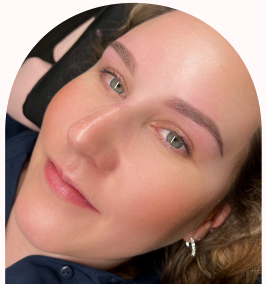
Ombre healed after 12 months

Ombre, also sometimes called shading, is created using a small cosmetic tattoo machine and a sterile, single use disposable needle. The machine lowers the needle at high speed and pricks the skin to deposit the pigment. Ombre technique fills in the entire brow, and creates a soft powdery look once healed that is not unlike the look you get when you pencil your brows in.