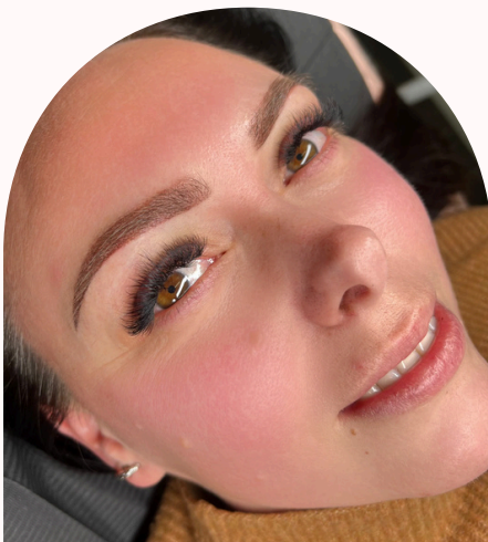
Ombre immediately after

Thank you for taking the time to learn more about Cosmetic Tattooing. We are excited for you....and your brows.