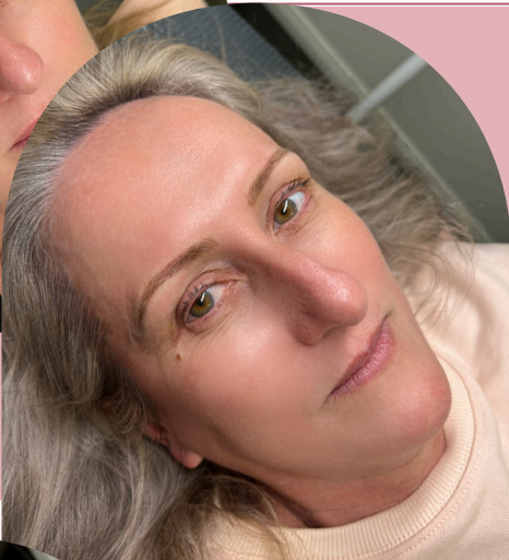
Microblading immediately after