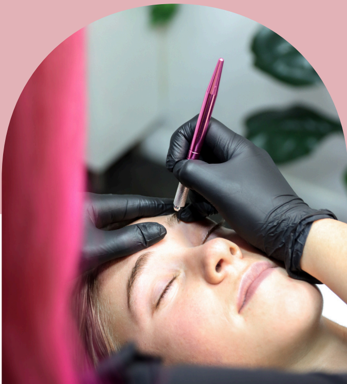
Microblading in process

Initial tattoo: 3 hours ($650) 6-8 week touch up: 2 hours ($150) 6-18 month touch up: 2 hours ($400)