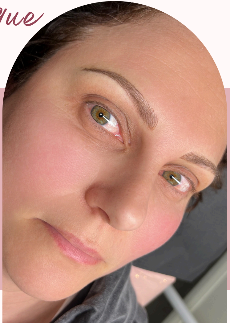
Microblading immediately after