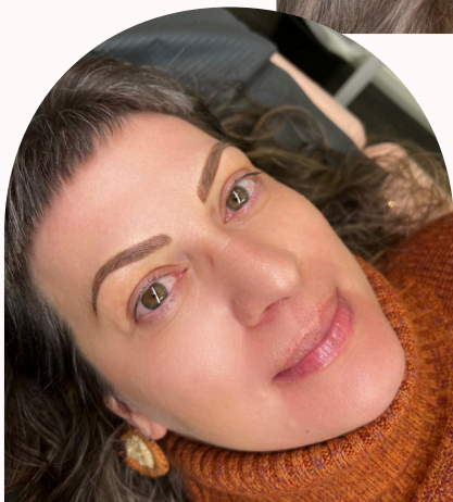
Combination Immediately after