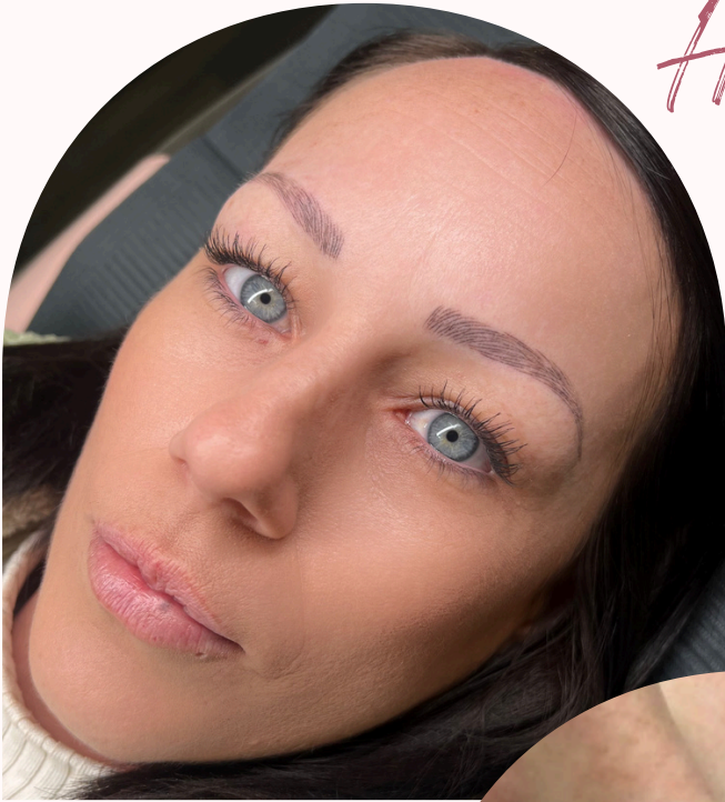
Microblading healed before touch up