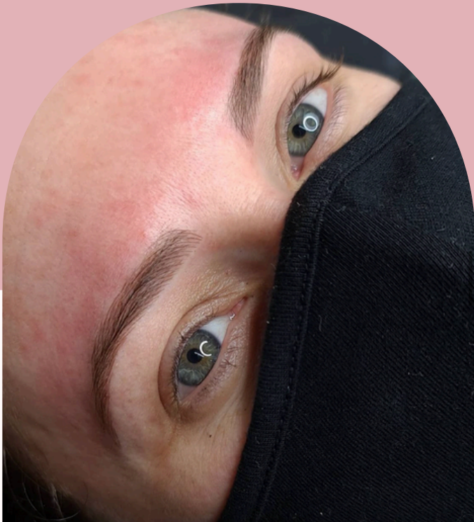
Microblading immediately after

Written Doctors approval is required for any clients who suffer from Epilepsy or seizures, diabetes, blood clotting problems. Recently completed chemotherapy or radiation treatment.