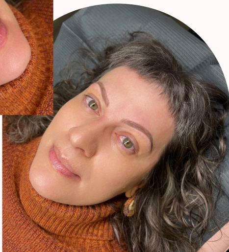
Combination healed after 6 weeks