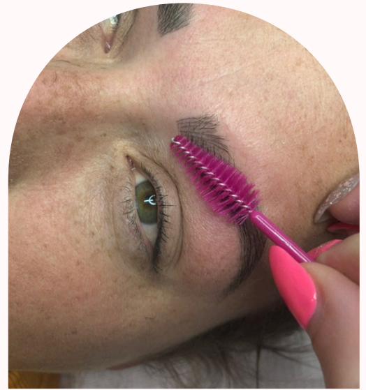
Microblading healed before touch up