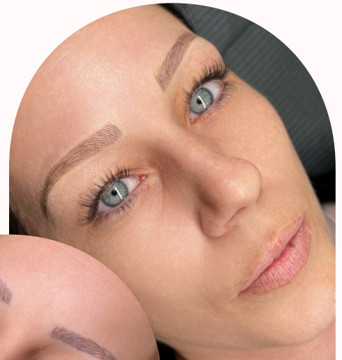
Microblading immediately after

We get it, sometimes the immediately after results can be a little bit intimidating. Especially if you are wanting a really natural result from your brows. It is important to remember that each brow is bespoke and has been designed for that specific client and their requests as well as the result they were wanting to achieve. Brows can be made to be as bold or as natural as you want. That being said, it is important to understand the difference between a healed brow and a freshly done brow as they do vary quite a bit.