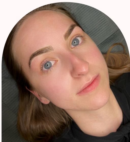
Microblading immediately after