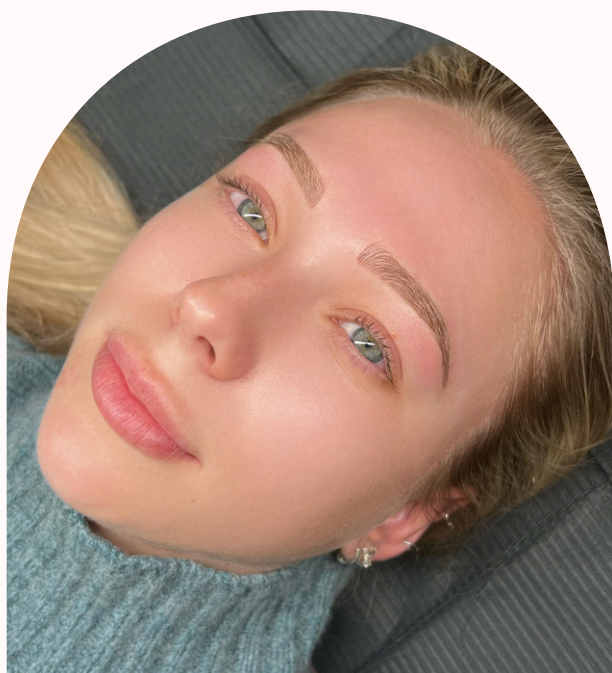
Microblading immediately after

When Microblading is first done you will need to have a touch up done in 6-8 weeks time. This is to reinforce the strokes we created at the first appointment and add extra dimension to the tattoo. Slight changes to the shape and colour can be made if necessary and adjustments can be made to any areas that has any colour drop out. After this touchup, we recommend touchups every 6-18 months to maintain the look of your tattoo. Anything over 2 years is recognised as initial tattoo again.