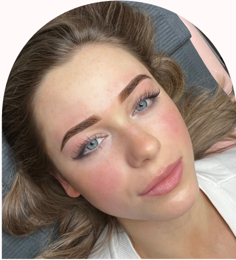
Ombre immediately after