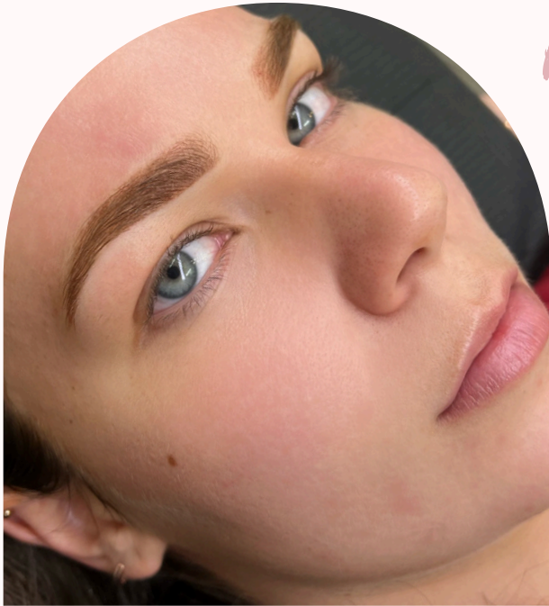
Ombre Immediately after