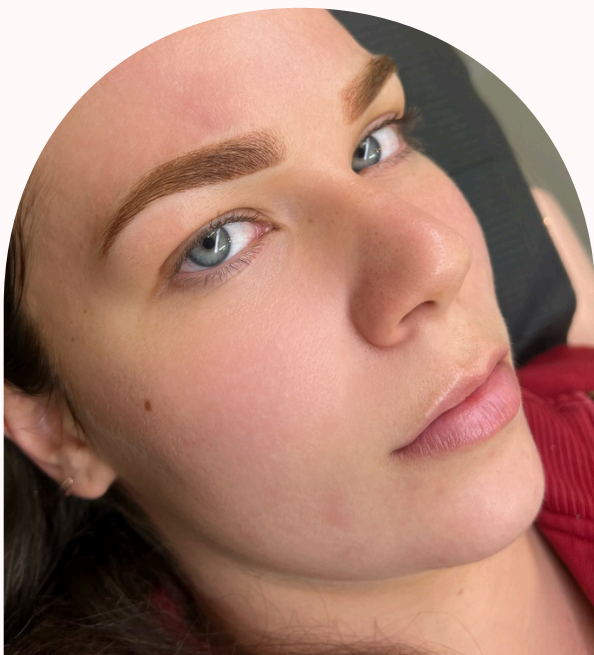
Ombre healed before touch up

Much the same as Microblading, when you first have your Ombre brows done, you will need to have a touch up done in 6-8 weeks time. This is to deposit more pigment to ensure you have a beautiful even saturation with your tattoo. Depending on how the tattoo heals, most clients only require a very small touch up. Slight changes to the shape and colour can be made if necessary and adjustments can be made to any areas that has any colour drop out. After this touchup, we recommend touchups every 1-2 years to maintain the look of your tattoo. Anything over 2 years is recognised as an initial tattoo again.