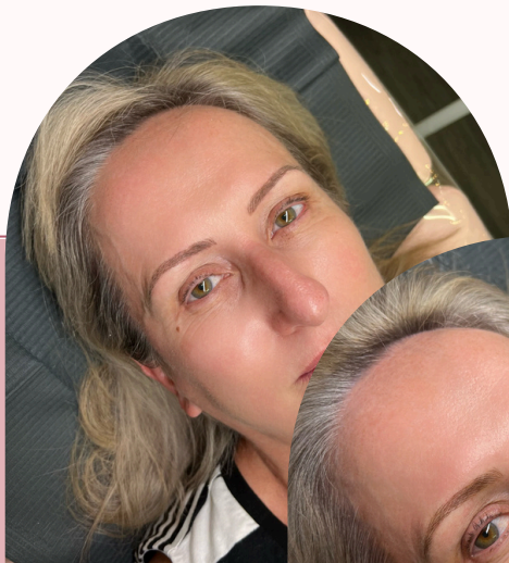
Microblading healed after 6 weeks