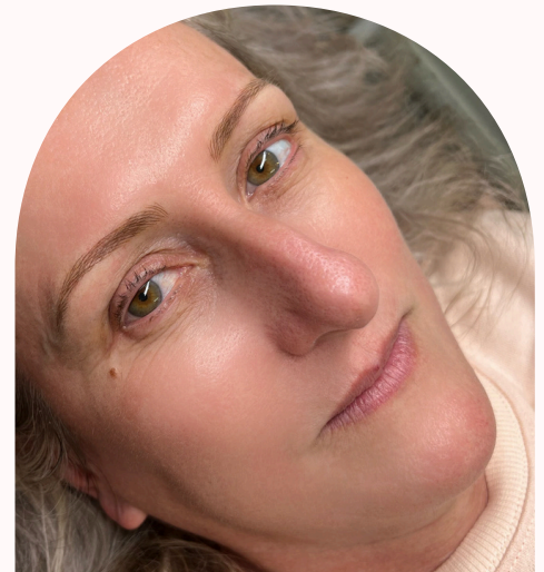
Microblading immediately after