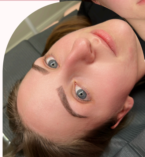
Microblading healed after 6 weeks