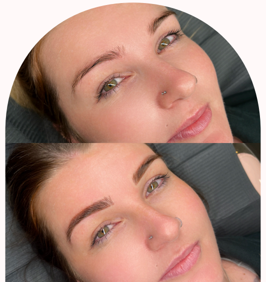
Before and after Combination

To create combination brows we implant Microbladed strokes at the front which beautifully blends into shading throughout the rest of the brow. Combination brows can be tailored to the individual and can have more of one technique than the other depending on the desired look you are hoping to achieve. Combination can be good for clients who really want that fluffy look but do not have suitable skin for Microblading or have wrinkly thin skin towards the tails of the brows.