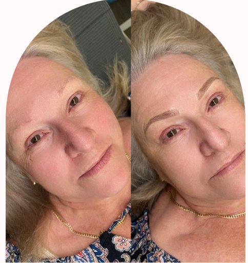
Microblading before and after

Recent changes to medications or health concerns can also effect the healed result of the tattoo so it is important to discuss this with your tattoo artist.